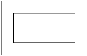
TOP PLAN VIEW

NOTE: ALL CONCRETE MEETS WVDOH CLASS B+1